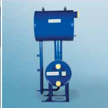
Flooded evaporator 600 kW