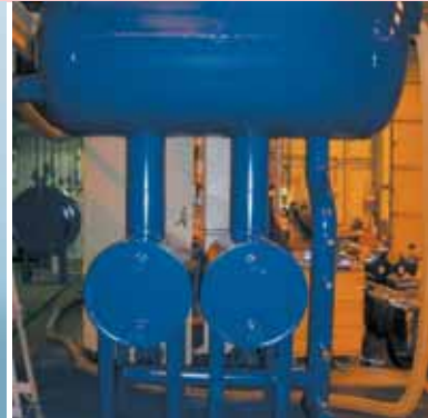
Flooded evaporator 3300 kW