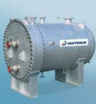
Internal droplet separator (kettle- type), shell ø 1600 mm, 14 MW