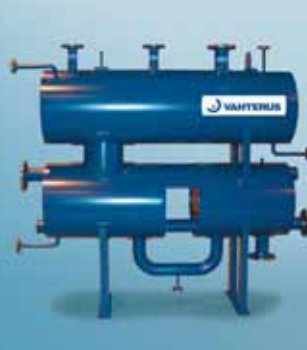
Preheater + evaporator + droplet separator ø 610 mm, 1340 kW