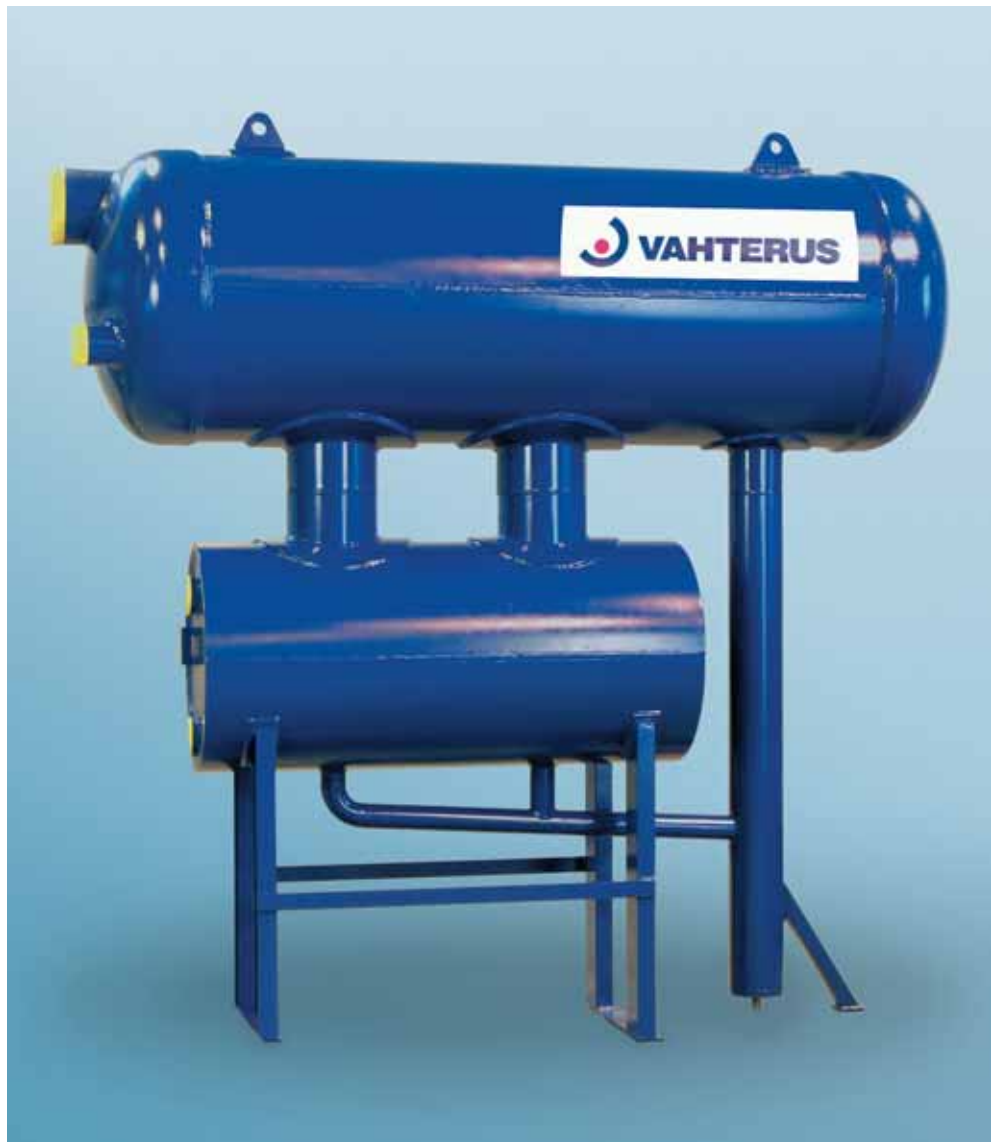
Flooded cascade, CO 2 condenser & NH 3 evaporator 660 kW