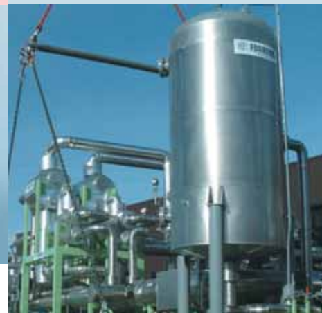
Water heaters with steam 40 bar (Hot water module 40 MW, FPSO ship)