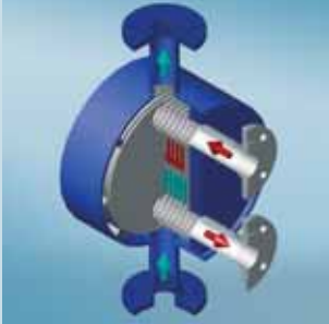
Plate & Shell®, Compact