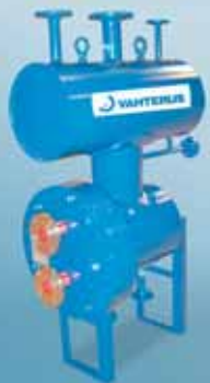
External droplet separator ø 400 mm, 750 kW