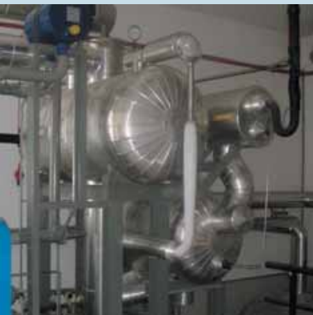
Flooded cascade, de-superheater & auxiliary cooler 580 kW