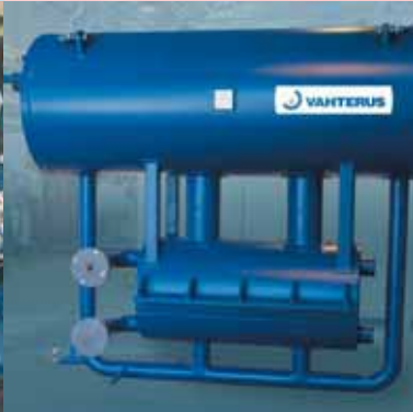
Flooded evaporator 365 kW