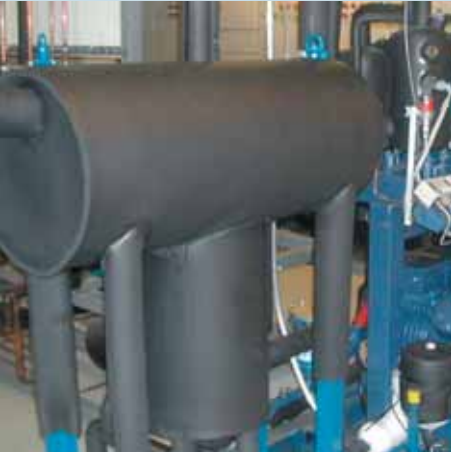
DX-cascade, subcooler & receiver 40 kW