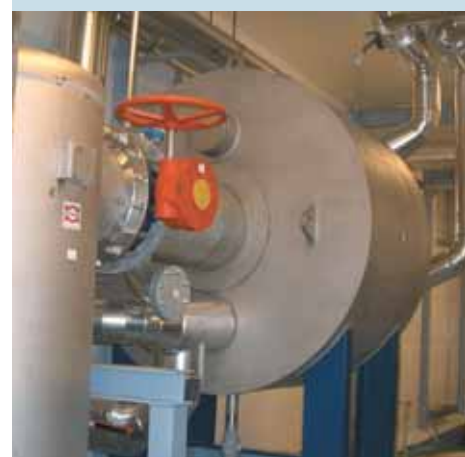
Biogas cooler/condenser 300 kW (Biogas pumping station)