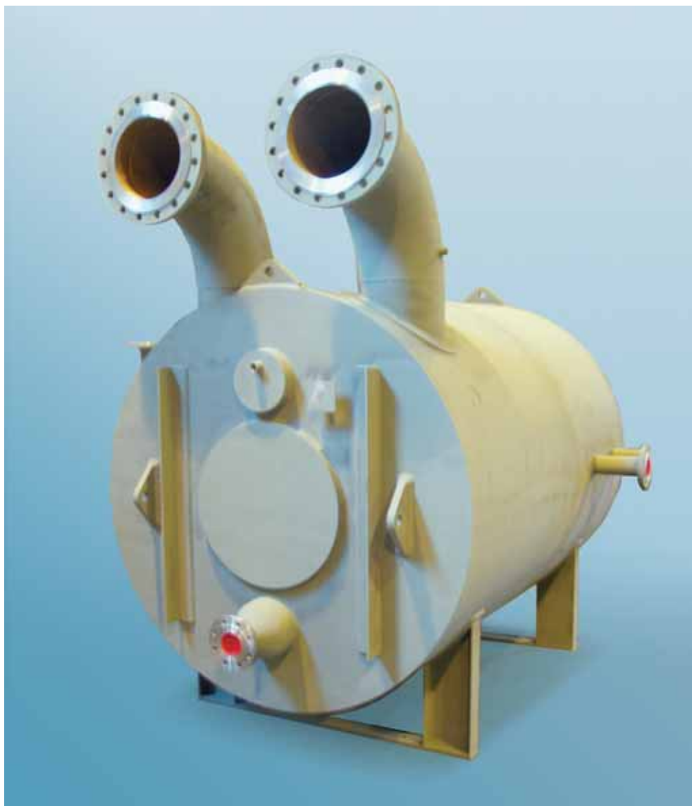
Gas/liquid economizer 1,2 MW